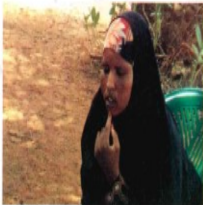
KALIMO RELIEF AND DEVELOPMENT

Through One Great Hour of Sharing, we become the household of God. We extend shelter to those who have no place to stay, offer compassion to those who have pain—be it physical, emotional or spiritual—and we set a feast, with God, for those who lack access to enough food to eat. God's household filled with love and everyone is welcome.